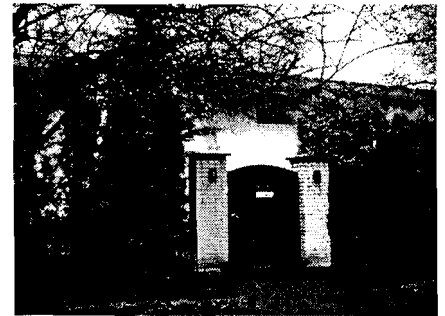
The garden gate entrance to the Seattle Shambhala Center

Please support the generous advertisers from our community businesses. The valley view would not be possible without them. Thanks a bunch!