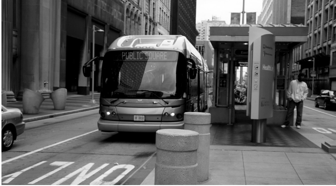
HealthLine, Cleveland, OH

The Madison Corridor BRT study is developing a preferred design concept to make transit service more reliable, frequent, and comfortable along Madison, from the downtown waterfront to Madison Valley. It is also an opportunity to improve the street for those who walk, bike, and visit destinations along Madison.