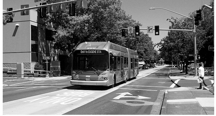
EmX, Eugene, Oregon

These are presented in more detail on the back of this sheet.