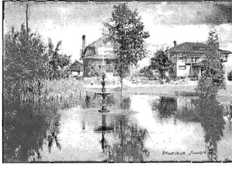
Minerva Fountain at Denny-Blaine Lake Park, 1904

Minerva Stone Blaine, Blaine's wife, is commemorated by the name of the pond where East Denny Way turns into Madrona Drive. It was dedicated as the "Minerva Fountain," and