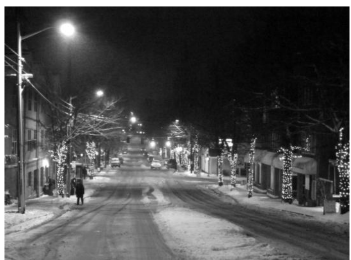
January Snowstorm cloaks Madison St. in an otherworldly glow at night, with illuminated trees framing a winter promenade. Madison restaurants stayed open during the storm, packed with hungry locals.

SEATTLE COMMUNITY COUNCIL FEDERATION MEMBER