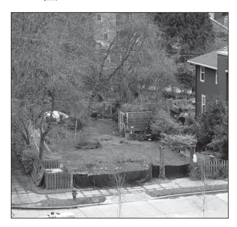
Condemned cottage demolished to create garden. The adjacent property owner on 30th Avenue East has purchased the lot where the little green house stood empty for two years following the tragic death of Kate Fleming in the December flood of 2006. The house was razed in January and the empty lot will be converted into a large garden.