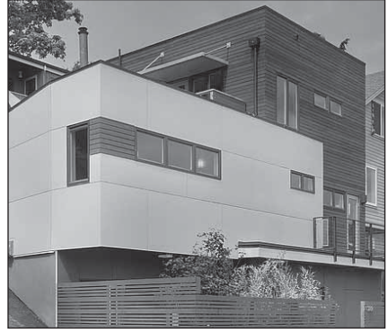
The "Alley House"

In the nearly ten years that I've lived in Seattle, the city has continued to become what I call a beige, faux-craftsman townhome sprawl. I've lived and visited other parts of the country where dense residential housing has added to the quality of life—both visibly and practically in the form of tight com-