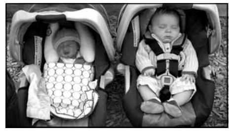
Two attendees (3 wks and 3 mos), exhausted from all the excitement

The Greater Madison Valley Community Council sends you The Valley View for free , nine times a year. Each issue costs approximately 50 cents per person, or about $5 a year. While the price of publishing and mailing each newsletter is partially offset by advertising costs, we are still under-funded and can only continue to publish with your donations! Please consider sending us a tax-free contribution, by writing a check to GMVCC. We are grateful for any amount.