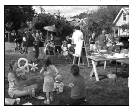
150 Madison Valley neighbors joined in the fun

Thanks to a small but dedicated group of volunteers, the 2<sup>nd</sup> Annual Madison Valley Summer Barbeque was a true success!!